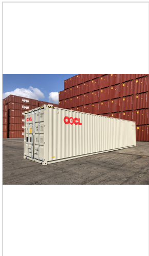
Inland Logistics Container