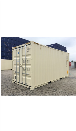
20'HC Dry Container