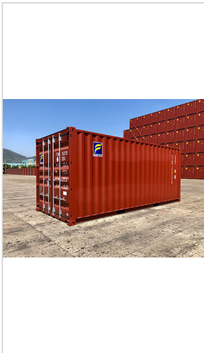
20'GP Dry Container