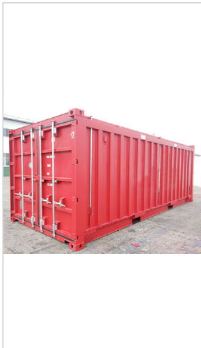
20' FT Bulk Container