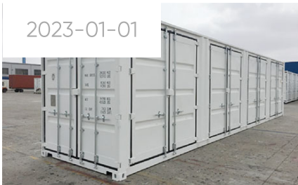
THE FIRST ISSUE: STANDARD